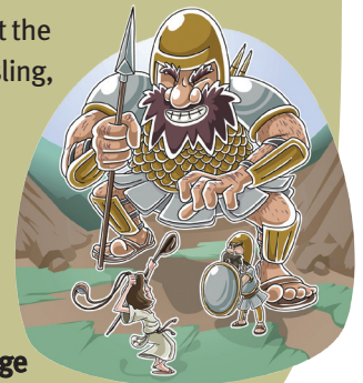
Bible story based on 1 Samuel 17

This was a day no-one would forget, when the courage of a shepherd boy saved a nation.